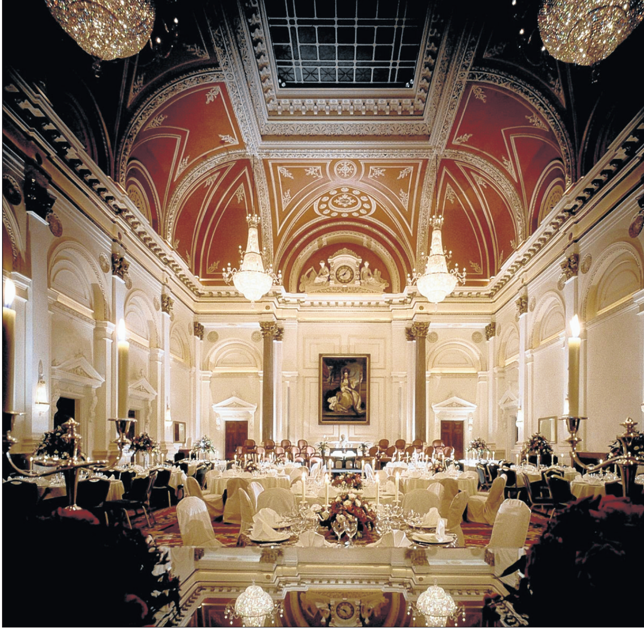
MAGNIFICENT: The Banking Hall, Westin Hotel