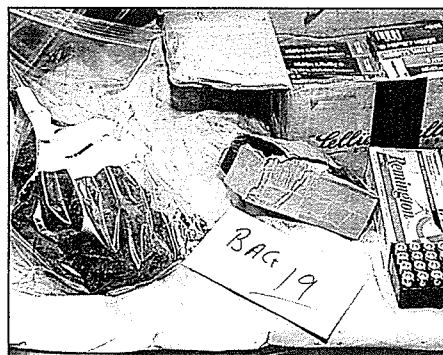
Arsenal: Ammunition and cannabis that gardaí seized