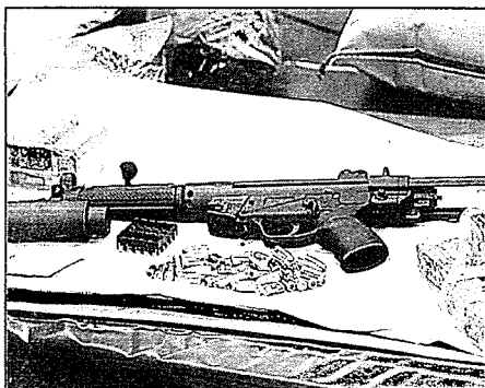
Serious weapon: The submachine gun found at the scene

Gardaí begin search for men who left behind €11m worth of drugs as they jumped 30ft from apartment to evade capture