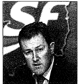
SEEKING MEETING: Sinn Fein MP Conor Murphy

A police spokeswoman said: "The PSNI meet regularly with political representatives and are in the process of arranging a meeting with Mr Murphy."